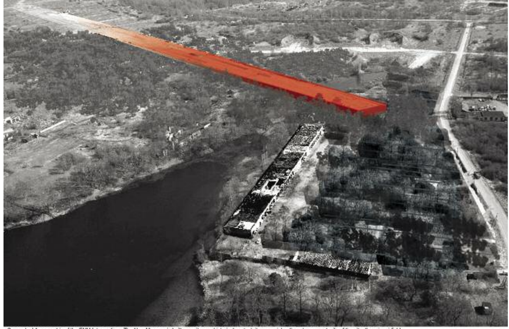
Conceptual Aronometric of the ENM Intervention - The New Museum is built upon its own historical context, it appropriates the urban opportunity of the site, the prior airfield platform onto its own roof