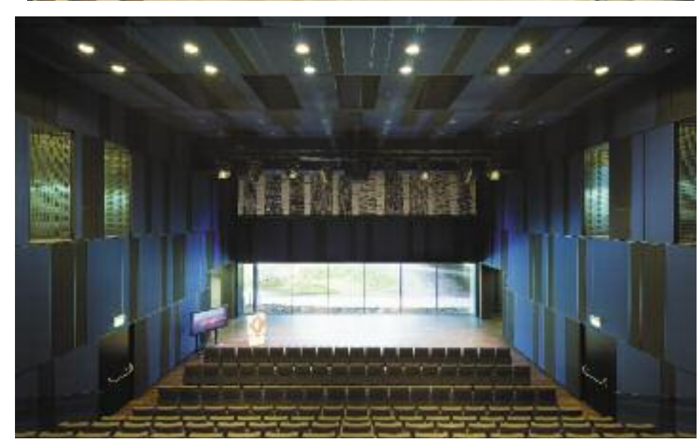
2017 Competitions Annual